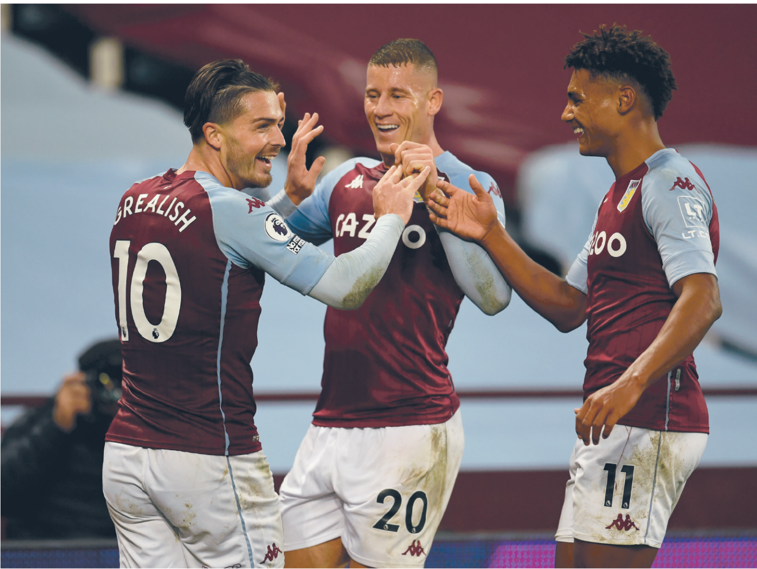
Aston Villa's Jack Grealish, celebrates after scoring his side's seventh goal with Aston Villa's Ross Barkley, center, and Aston Villa's Ollie Watkins during the English Premier League soccer match between Aston Villa and Liverpool at the Villa Park stadium in Birmingham, England, Sunday, Oct. 4, 2020.

when the league had "Barclays" in its name in terms of high-energy games and pure upsets. I would also heavily argue that Tottenham's current form has to do with Mourinho's project at the North London club. With their recent signings of Matt Doherty, Pierre-Emile Højbjerg and Sergio Reguilón to name a few, they've all added the depth and chemistry the club have long needed to compete. With the international break this week, this will be perfect for Tottenham to rest up and continue their form