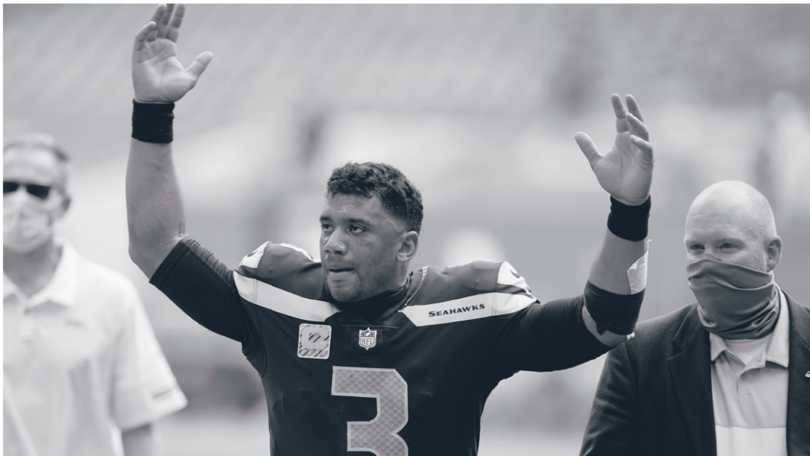
Seattle Seahawks quarterback Russell Wilson (3) raises his hands as fans cheer at the end of an NFL football game, Sunday, Oct. 4, 2020 in Miami Gardens, Florida. The Seahawks defeated the Dolphins 31-23.

The Cowboys defense has been atrocious this season, allowing 38 points or more each of the last three weeks. The only win Dallas has is the result of Prescott taking advantage of a Falcons collapse and throwing for 450 yards. Like Watson, Prescott is not the reason for the Cowboys' struggles. The defense has put him in bad positions in almost every game, and he's had to work his hardest to overcome that. It's sad to think about, but there's a real possibility that Prescott has the best passing season in NFL history and still goes 5-11 and misses the playoffs. How 'bout them Cowboys? 5. Josh Allen, Buffalo Bills Allen has been the biggest quarterback surprise by far this season. He wasn't bad last year, but he wasn't anything special. This year, he's special. He's thrown for 1,326 yards and 12 touchdowns, both of which are second in the league at the time of writing. He also has the second best passer rating at 122.7. He's only thrown one interception and has added three rushing touchdowns as well. The Bills are 4-0 right now and look like legitimate Super Bowl contenders because of Allen. His improvement in accuracy has been a big reason for his success. Allen, who completed under 59% of his throws last year, is completing almost 71% of his passes. That's a big one-year leap. He's the definition of a dual-threat quarterback with the way