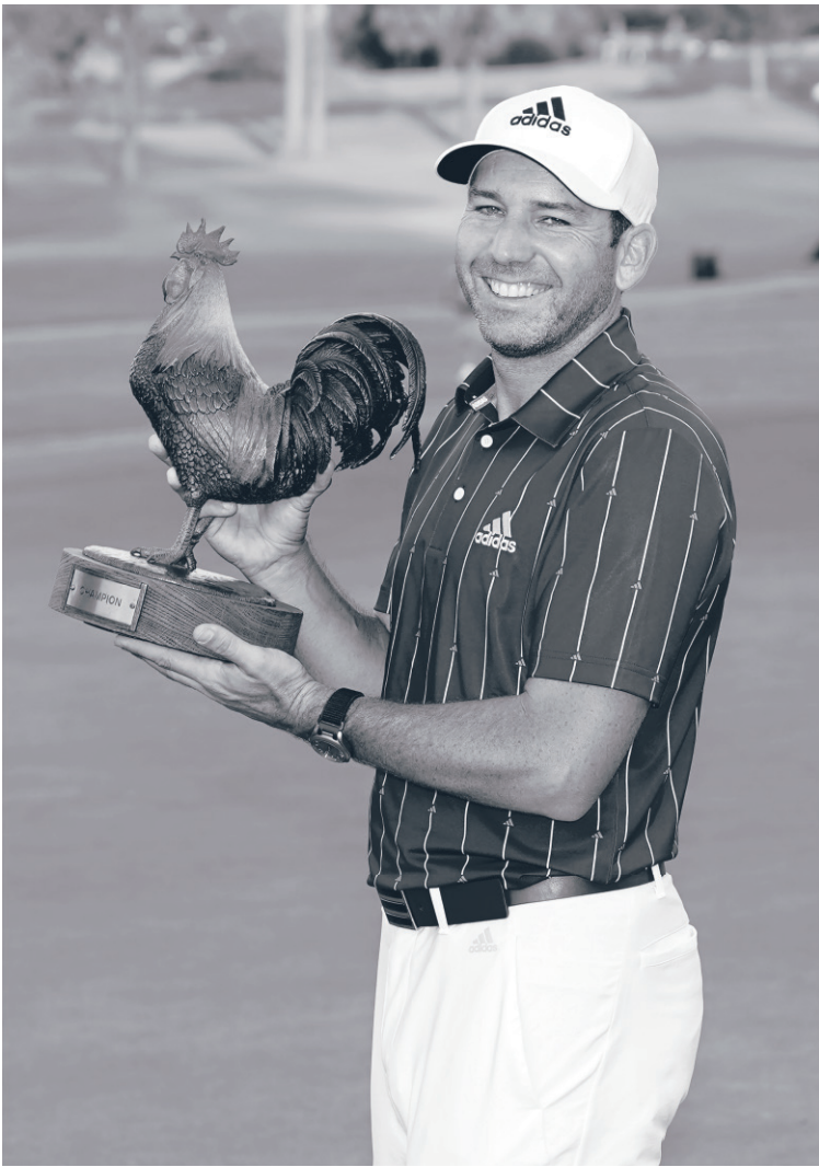
Sergio Garcia, of Spain, holds the Sanderson Farms Championship trophy after winning the PGA golf tournament in Jackson, Mississippi., Sunday, Oct. 4, 2020.