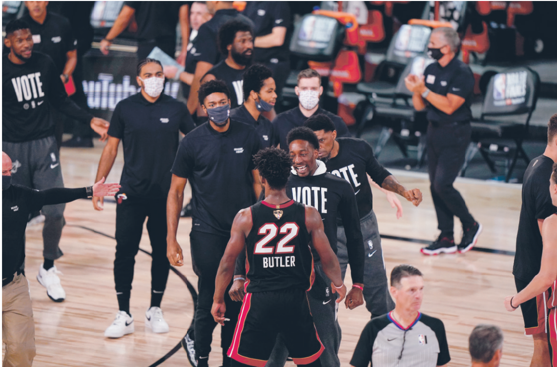
Miami Heat's Bam Adebayo, center, congratulates Miami Heat's Jimmy Butler (22) after a win against the Los Angeles Lakers 115-104 during the second half in Game 3 of basketball's NBA Finals, Sunday, Oct. 4, 2020, in Lake Buena Vista, Florida.

The Heat put together a solid game, hitting the 50-40-90 mark as a team and moving the ball effectively through Jimmy Butler. Without two of his biggest weapons and ball handlers, Butler played a relatively passive role, scoring 25 points on just 7-17 shooting, but piling on