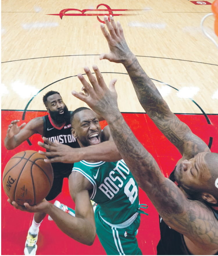
Boston Celtics' Kemba Walker (8) goes up for a shot as Houston Rockets' P.J. Tucker, right, defends during the first half of an NBA basketball game Tuesday, Feb. 11, 2020, in Houston.