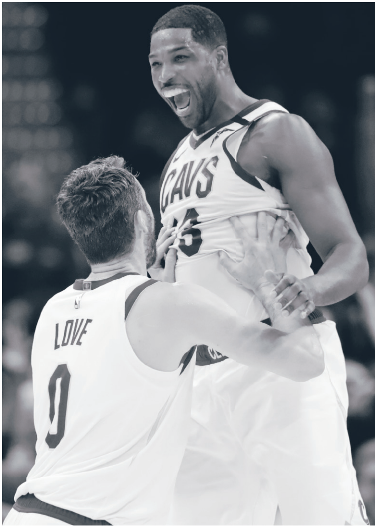
Cleveland Cavaliers’ Tristan Thompson (13) and Kevin Love (0) celebrate after they defeated the Miami Heat in overtime in an NBA basketball game, Monday, Feb. 24, 2020, in Cleveland.

ary against the cap that Capela had, so there won’t be pressure to give him minutes if their 3-pointers are falling. But he’ll give Houston the flexibility to adjust if they aren’t.