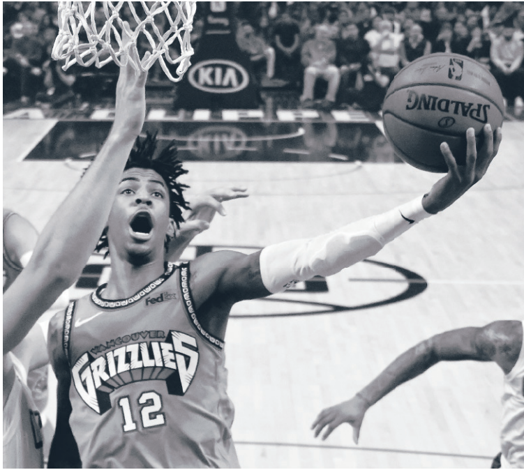
Memphis Grizzlies guard Ja Morant, right, shoots as Los Angeles Clippers center Ivica Zubac defends during the first half of an NBA basketball game Monday, Feb. 24, 2020, in Los Angeles.

Zion’s downfall for me, however, is that small sample size of 12 games and what it means for the rest of his season. Not only is the 37 games max he can play too small to truly be considered for the award, but it will not allow