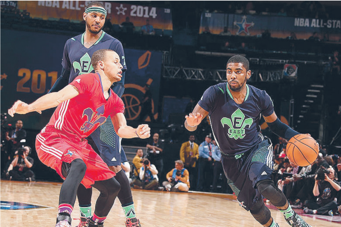
Kyrie Irving drives against Steph Curry while Carmelo Anthony during the 2014 NBA All-Star Game. Since, Irving has been traded from the Cleveland Cavaliers to the Boston Celtics and then signed with the Brooklyn Nets in free agency.

This one is too easy for me, because I've had Kyrie Irving on my favorite team, and it was not beneficial whatsoever. However, I am going to try to be as objective as a Celtics fan can be about Mr. Irving. He has the talent to be one of the top five — if not the top three — point guards in basketball, but he has one fatal flaw: He thinks he can lead a team, and he's proven time and time again that he cannot. Let's look at his track record. In his first three years in Cleveland, he played some great individual basketball, but the team was terrible, finishing far under .500 in every season. Once LeBron James and Kevin Love came to town, Irving was able to become a secondary guy on the team, and the Cavaliers went to three straight NBA Finals. They won one in 2016, coming back from down 3-1 to beat the 73-9 Golden State Warriors. Irving was terrific in those games, even hitting the game-winning shot in Game 7, but that was clearly LeBron's team. After losing in the Finals in 2017, Irving demanded a trade, basically saying he was tired of being