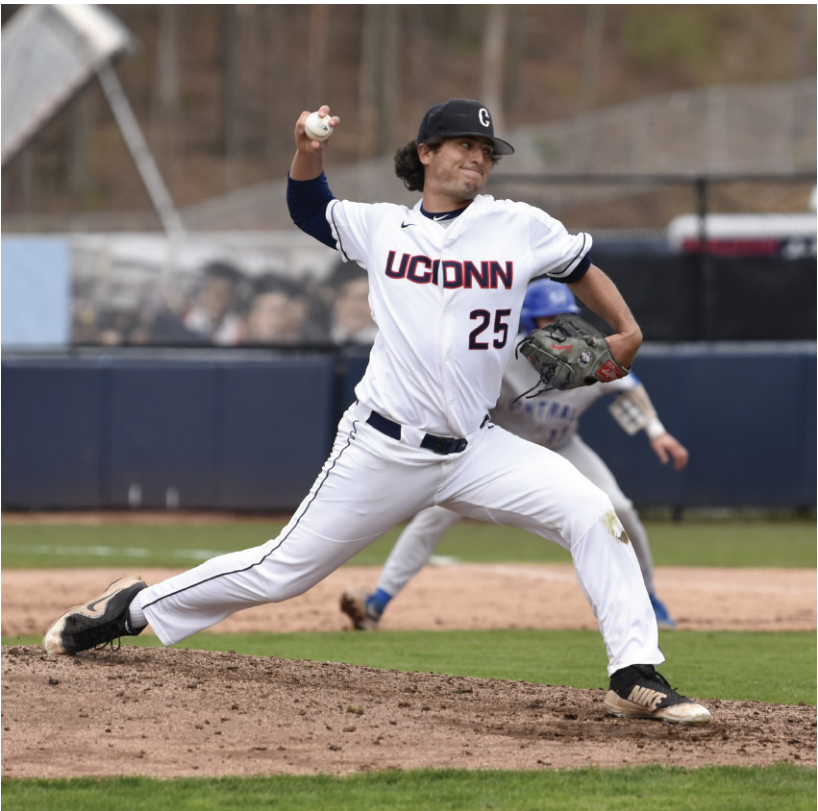
In this file photo, UConn baseball takes home a 9-1 win against Central Connecticut State University. This weekend, the Huskies will take on St. Joseph's.