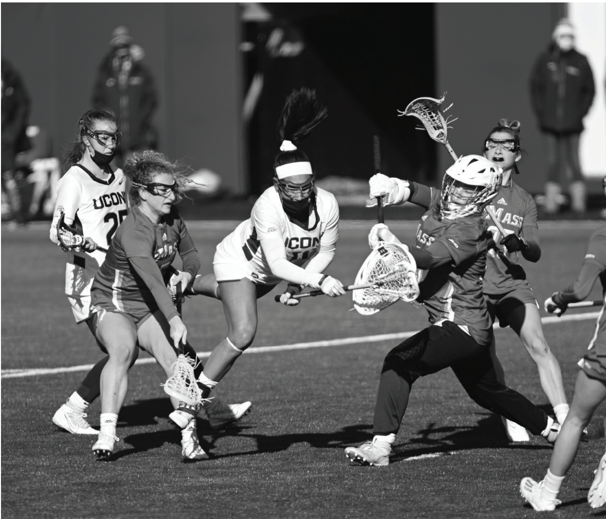
In this file photo, UConn women’s lacrosse battled to a 12-11 victory over No. 22 UMass on March 7, 2021. This weekend, UConn will take on Marquette.