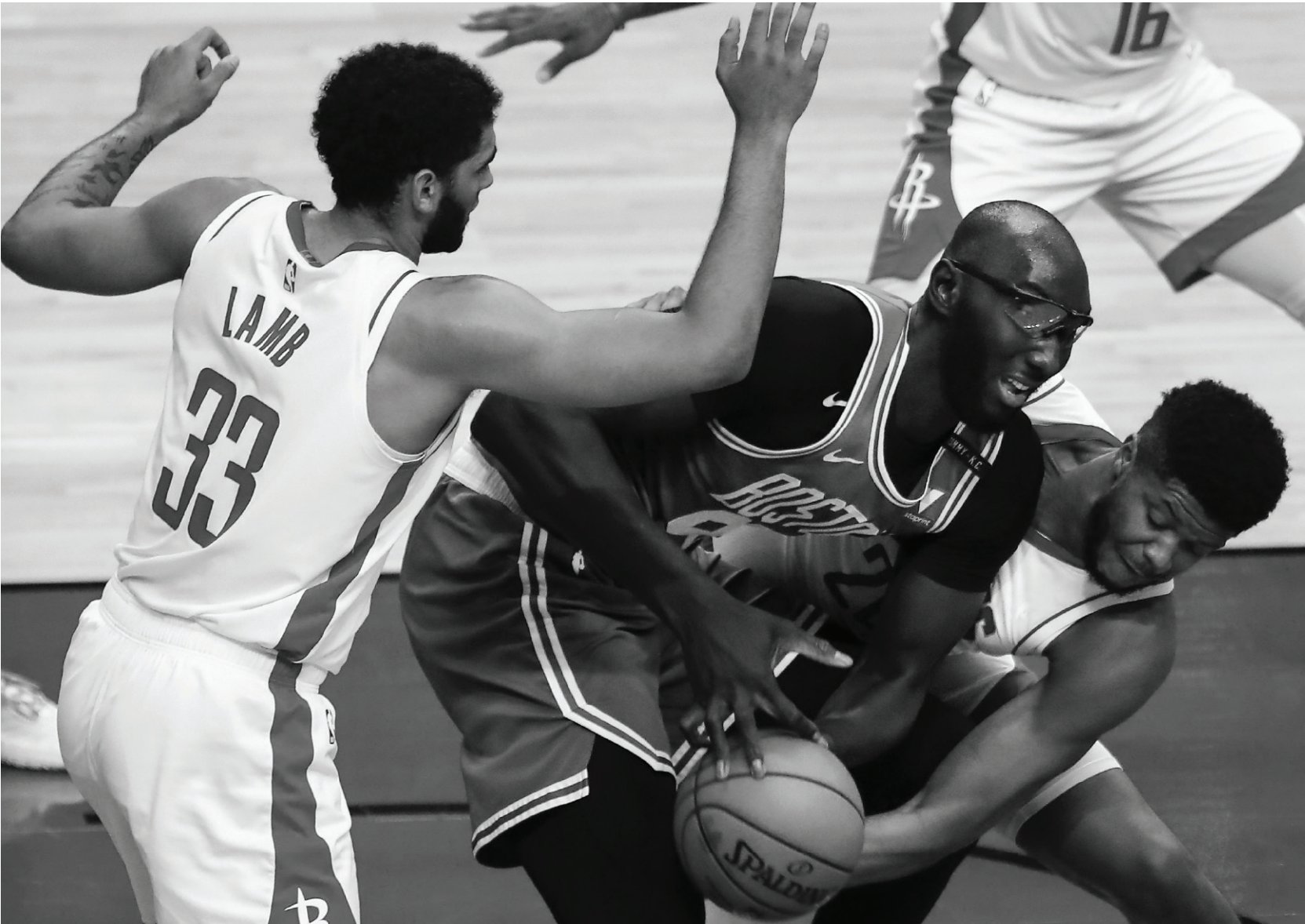
Houston Rockets forward Anthony Lamb (33) and center Justin Patton (26) battle with Boston Celtics center Tacko Fall (99) for the ball during the second half of an NBA game Sunday, March 14, 2021, in Houston.

torically large trade exception, and some young pieces that might interest some rebuilding teams, I would hope that the Celtics are players for big names in the coming weeks. I have been on the Harrison Barnes train all season, and even more so now with the Kings looking awful and the deadline rapidly approaching. This would be the best time for Ainge to steal Barnes from Sacramento, as the Kings forward has been great off the bench this year for them, averaging 16.6 points, 6.2 rebounds and 3.5 assists per game. His 36.7% shooting from 3 this year is also impressive, and add to that his good defense and the Celtics will finally have a good bench wing to help relieve some of the pressure for Brown and Tatum. Another name linked to the team as of late is Orlando Magic center Nikola Vucevic. The All-Star center has averaged 25 points, 11.6 rebounds and 3.7 assists per game on a terrible Magic team ravaged by injuries. While his value is high, I do believe it is possible to get him to Boston, where he would thrive as a