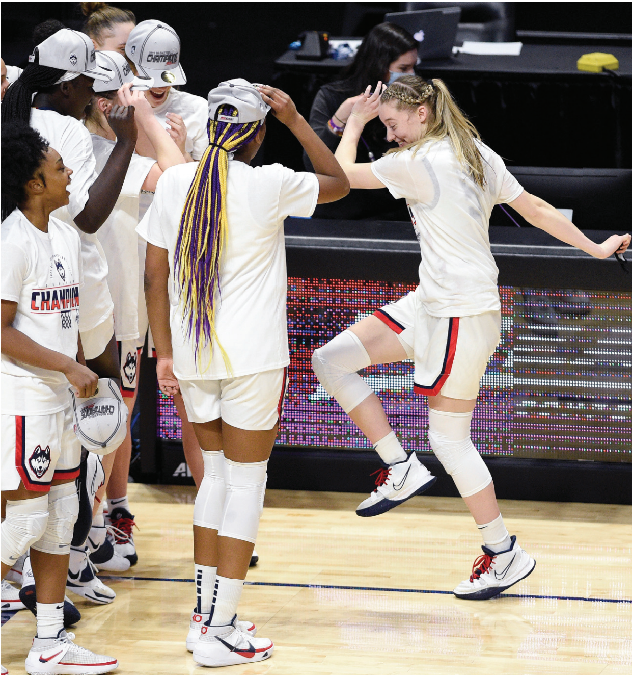
Connecticut's Paige Bueckers, right, dances over to teammates while celebrating an NCAA college basketball game win in the Big East tournament finals against Marquette at Mohegan Sun Arena in Uncasville, Conn, in this Monday, March 8, 2021, file photo. Bueckers has made The Associated Press All-America first team, announced Wednesday, March 17, 2021.

Bueckers — who was also just named a finalist for the Naismith