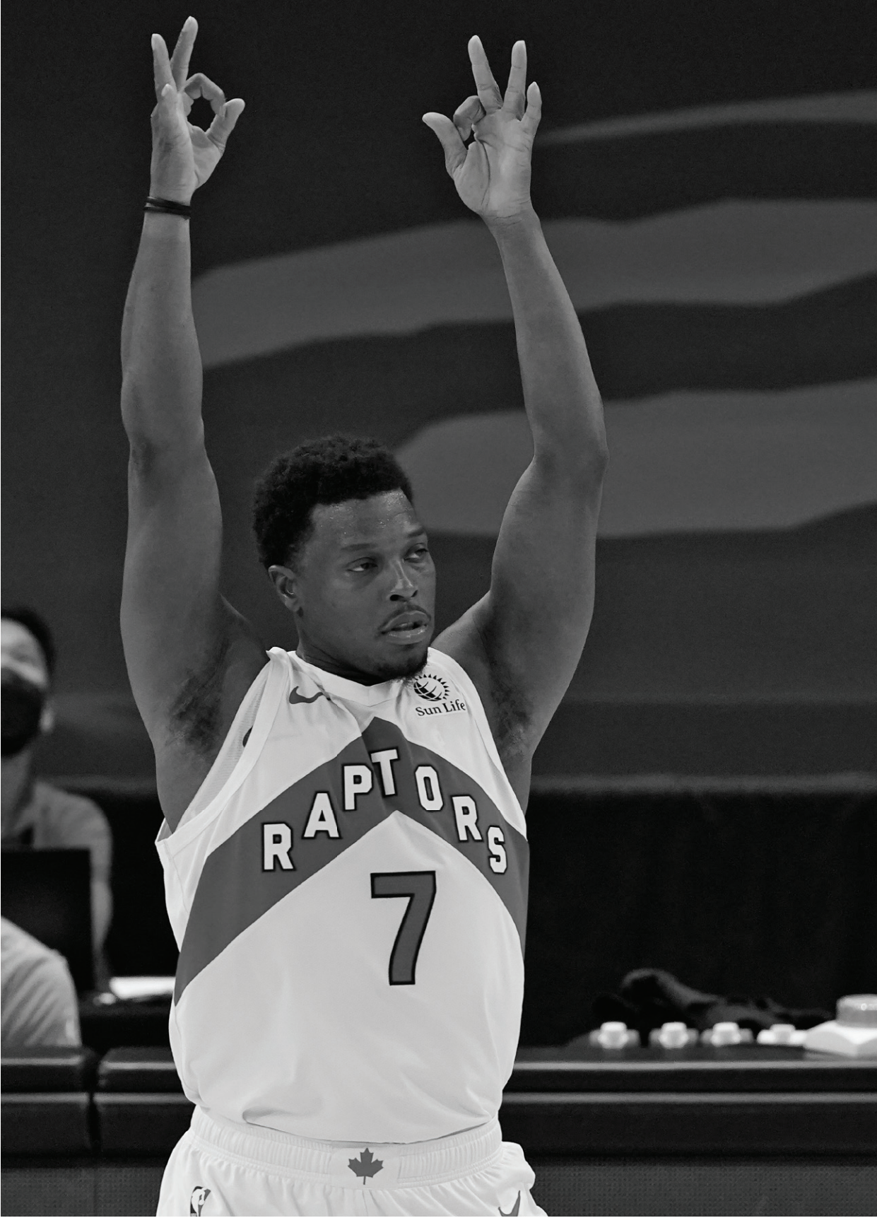
Toronto Raptors guard Kyle Lowry (7) celebrates a three-point basket during the second half of an NBA basketball game against the Denver Nuggets Wednesday, March 24, 2021, in Tampa, Fla.

Miami was a major pursuer for Lowry, and now simply may try to add him again as a free agent later this year. But the reigning Eastern Conference champions pivoted in time to add Oladipo — a two-time All-Star, a 21-point-per-game scorer this season and someone only three years removed from All-NBA status — from Houston, in exchange for