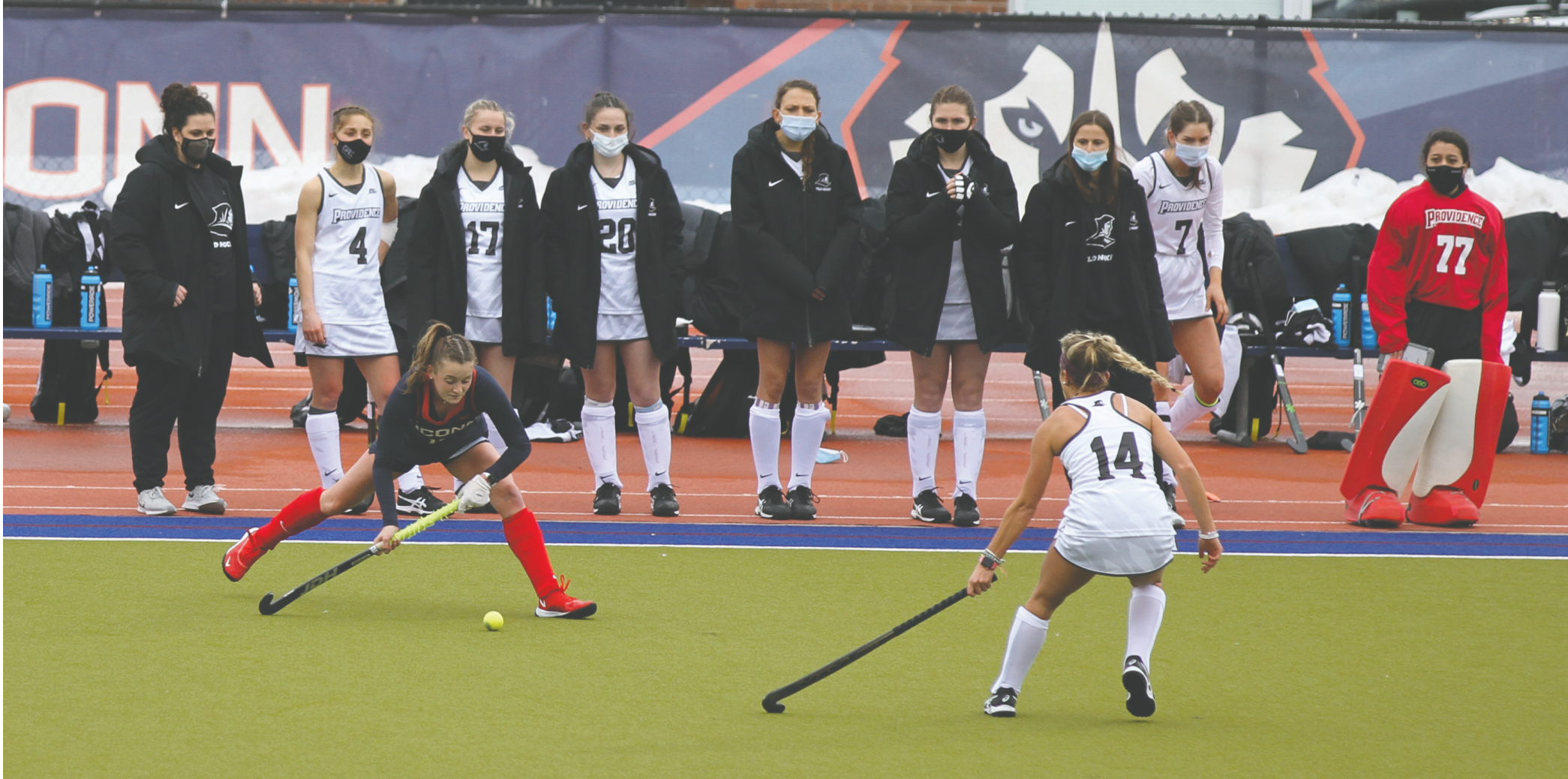
UConn field hockey battles Providence College to a 4-0 win on Feb. 28 to grab their second win of the season.