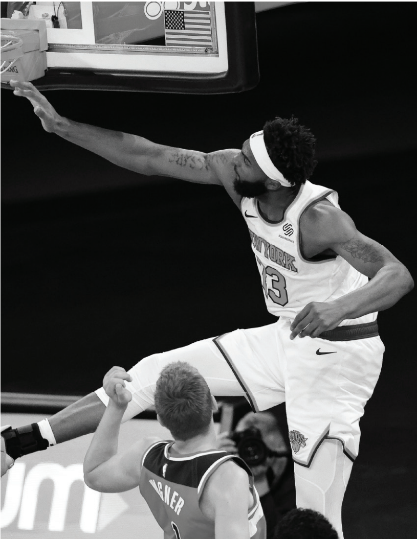
New York Knicks center Mitchell Robinson (23) dunks the ball over Washington Wizards center Moritz Wagner (21) during the first half of an NBA basketball game Tuesday, March 23, 2021, in New York.

It has been a wild trade deadline as they almost always are, and the fun will continue as key names are bought out and available for everyone to sign at low costs. Keep an eye out for Danny Ainge and the Celtics to add more names and try to turn this team around. Next week we'll see how the additions of Fournier and Wagner either help or hurt the team, and we will see if the Celtics can get back over .500 on the season.