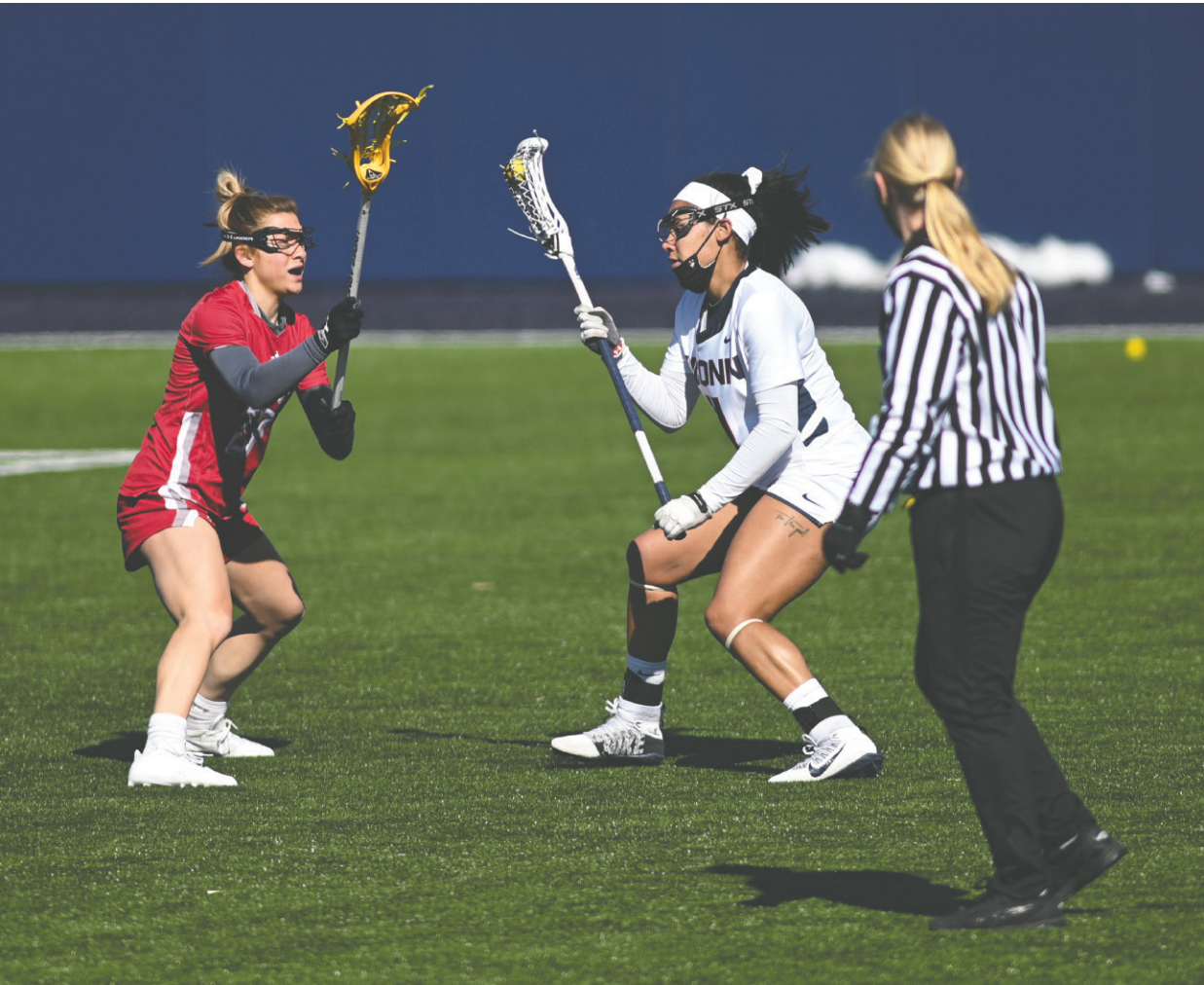
In this photo, UConn women’s lacrosse battled to a 12-11 victory over No. 22 UMass at UConn on March 7. This weekend they take on Butler.