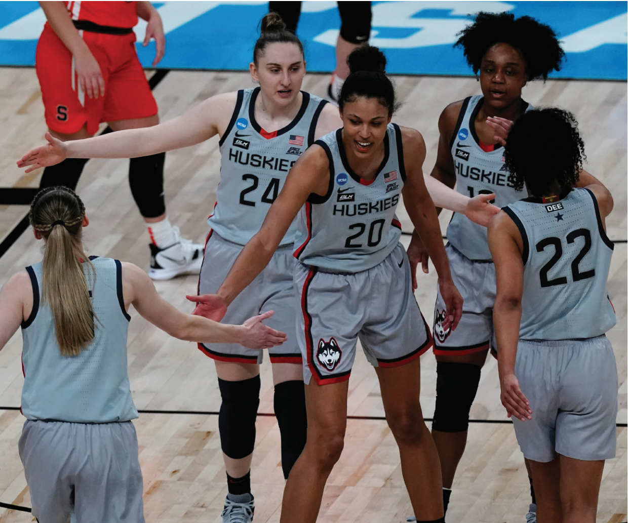
UConn players celebrate after a basket during the second half of a college basketball game against Syracuse in the second round of the women’s NCAA tournament at the Alamodome in San Antonio, Tuesday, March 23, 2021.