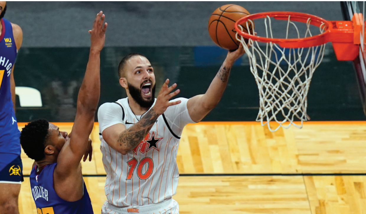
Orlando Magic guard Evan Fournier (10) gets past Denver Nuggets guard PJ Dozier, left, for a shot during the second half of an NBA basketball game, Tuesday, March 23, 2021, in Orlando, Fla.

Wrapping up a disappointing week, the Celtics limped into the trade deadline at a disappointing 21-23 and are currently in eighth place in the conference. After losing to the Milwaukee Bucks in dramatic fashion Wednesday night, the Celtics made a trade for former Orlando Magic guard Evan Fournier. We will discuss this and other blockbuster trades around the league and how they may affect the Celtics' postseason chances. Evan Fournier and Mo Wagner, and their impact on the Celtics I am split on this trade. On one hand, Fournier has had a very good offensive season for a terrible Orlando Magic team, scoring a career high 19.7 points per game on a very good 38.8% shooting from 3. He adds a solid catch and shoot option to a team that needed consistency