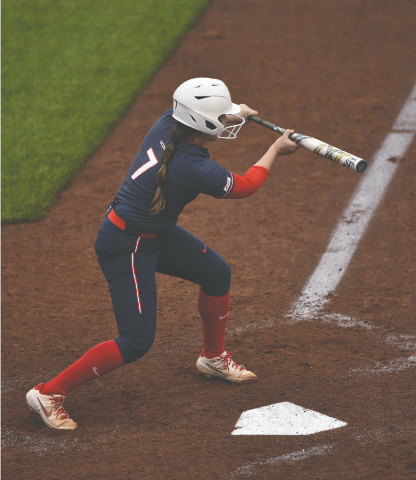
The UConn Huskies secure the win against Central Connecticut State University's Blue Devils with a final score of 10-2 after five innings on Wednesday, March 24, 2021.

However, Villanova is also a good team. They're sitting at 11-7 and have an eight-game winning streak, including wins over Butler, Hofstra and Towson. The fact that Butler lost to them is not necessarily an indication that Butler themselves are struggling massively, although giving up ten runs in three games while only scoring one is typically a bad sign for any team. The Huskies will be looking to keep Butler's offense on the backfoot once again in their series, though their pitching has been a little hot and cold this season. However, Butler's pitching has also been relatively decent, which means that they might be able to slow down the Huskies offense and make it difficult for them to score as many runs as they have in the last week or so. In addition, the weather could play a role. Sunday is predicted to have rain all day, which means the game could be more difficult or could end up being rained out, given it's predicted to rain half an inch. That could put a twist into the plans for the three-game weekend, but either way, this is a series for two teams to prove that they are, or are not, going to make this season a good one.