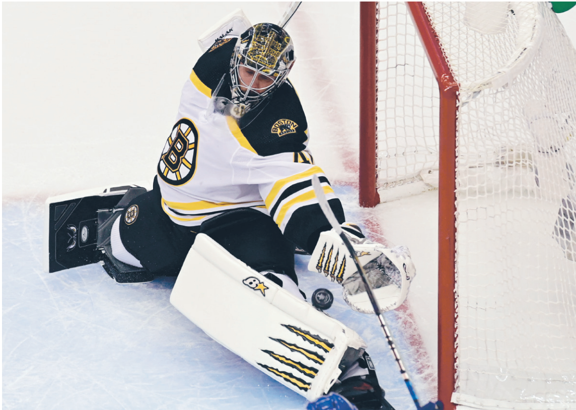
Boston Bruins goaltender Jaroslav Halak (41) reaches out to make a stop on Tampa Bay Lightning left wing Ondrej Palat (18) during the second period of an NHL Stanley Cup Eastern Conference playoff hockey game, Monday, Aug. 31, 2020, in Toronto.

Halak spent much of the 2019-2020 season playing in tandem with Rask for Boston, with Bruins coach Bruce Cassidy switching the two out every game. During the regular season, neither goalie outshined the other and both put up good, consistent numbers while in the crease. The pair earned the 2019-2020 William M. Jennings Trophy, annually awarded to the goaltender(s) that allowed the fewest goals scored against in the league. Halak ended the 2019-2020 regular season with 31 games played, 18 of those being Boston wins. He earned a goals against average of 2.39 and a respectable .919% save percentage. During the postseason series with the Carolina Hurricanes, Halak also performed well following the departure of