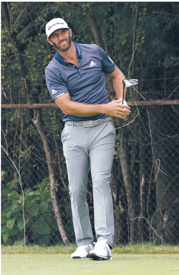
Dustin Johnson watches his tee shot on the second hole during the third round Saturday, Aug. 29, 2020, for the BMW Championship golf tournament at the Olympia Fields Country Club in Olympia Fields, Ill.

If this is any indication of the play we can see from these two, we are in for a very exciting Tour Championship next week. East Lake in Atlanta is another difficult course, and will give the remaining 30 players in contention a challenge as they compete for the title and the $15 million prize. However, the players have said they enjoy the strategy and precision that these hard courses require and are working hard to prepare for the final tournament of the Cup, which should make the Tour Championship the most exciting golf we have seen all year.